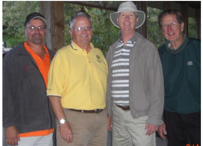
Second Flight winners.