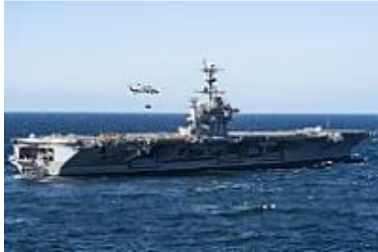
A U.S. Navy aircraft carrier on patrol in the Atlantic Ocean – March 2016

The Navy conducts ongoing research into new weapons systems. For example, LaWS, or Laser Weapon System, uses an infrared beam array to cripple or destroy an attacking vessel or aircraft. Rail guns, the stuff of science fiction until just a few years ago, use electromagnetism to