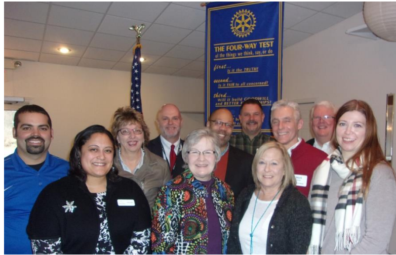
(BRC Charitable Grants recipients are identified on page 6.)