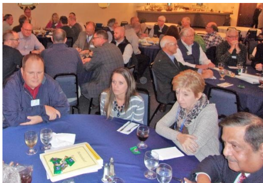
Nov. 30, 2016, meeting conversations