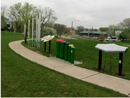
The chimes along Rotary Row at Faye's Field awaited children to come along and play them on a gloomy afternoon after the April 19 Rotary meeting.