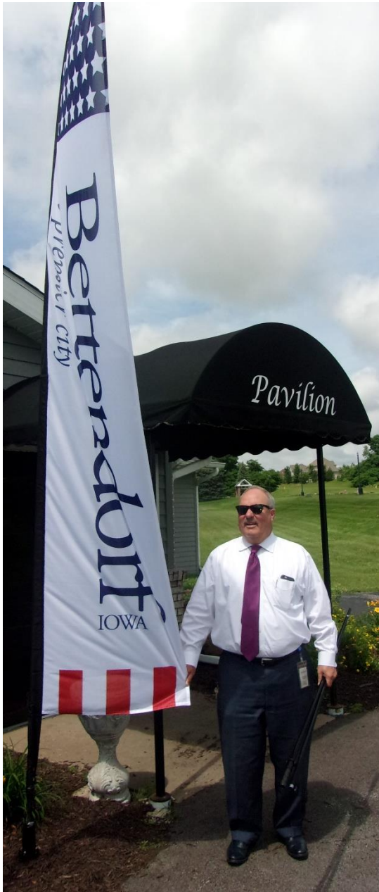
Banners will mark downtown parade route.

enter the complex from 18 th Street or Cumberland Square Drive, beside Azteca Mexican Restaurant.)