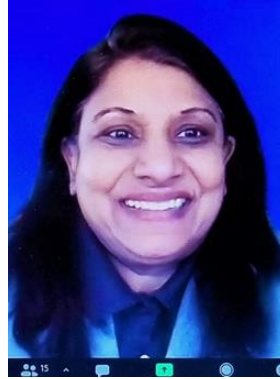
– Charles M. Schulz

The measure adopted by Rotary International encouraged "all Rotarians to become more familiar with the growing problem of modern-day slavery, to be vigilant and report suspicious activity in this regard, and to work towards solutions to end the practice in all its forms."